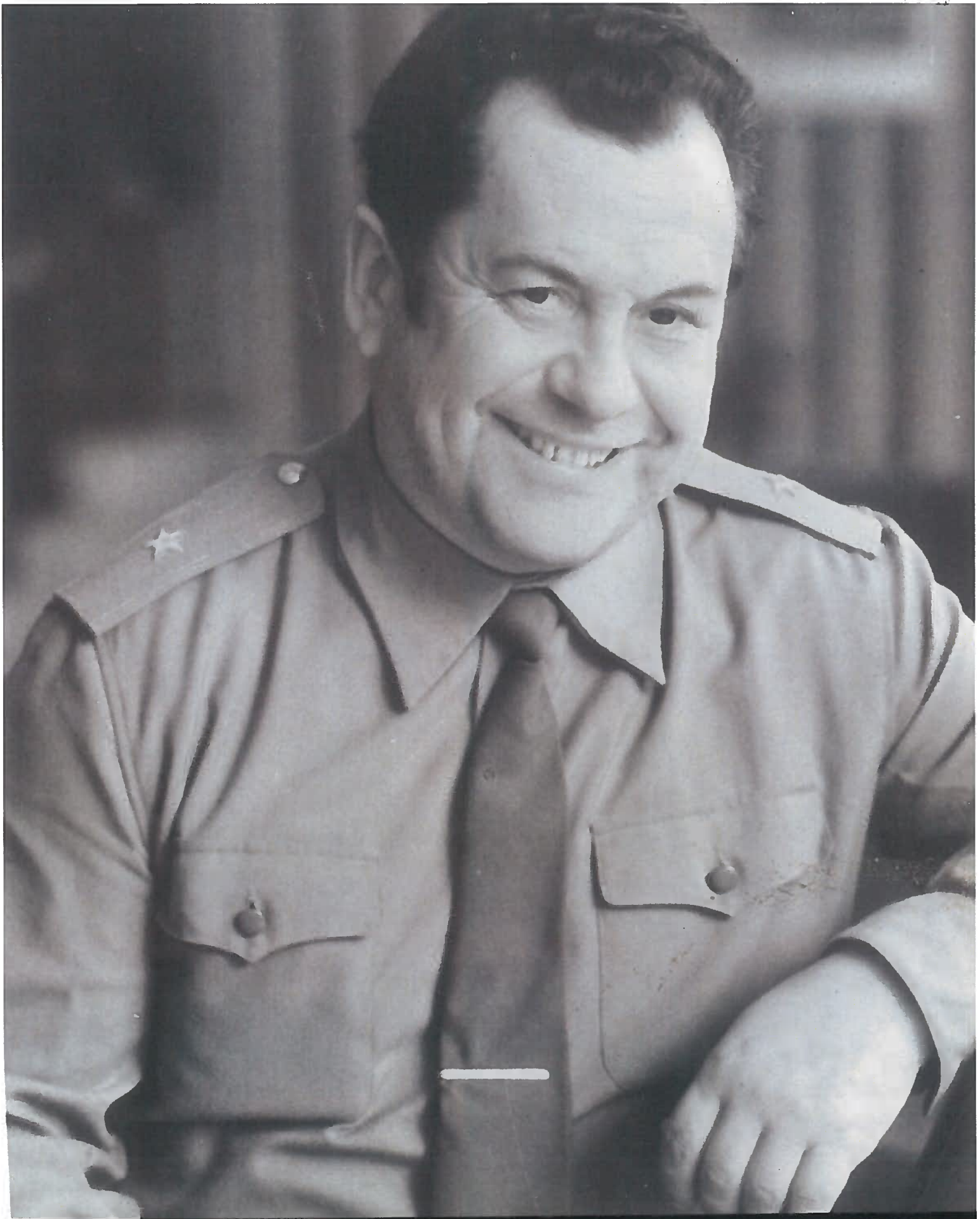
FORMER ARMY GENERAL PAVEL POPOVICH, COSMONAUT, DIRECTOR OF STAR CITY | PICTURE CIRCA: 1979