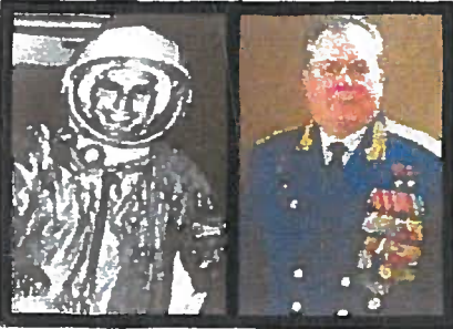
General Pavel Romanovch Popovich... was a Soviet Cosmonaut and was the fourth Cosmonaut in space, sixth person in orbit, and the eighth person in space.