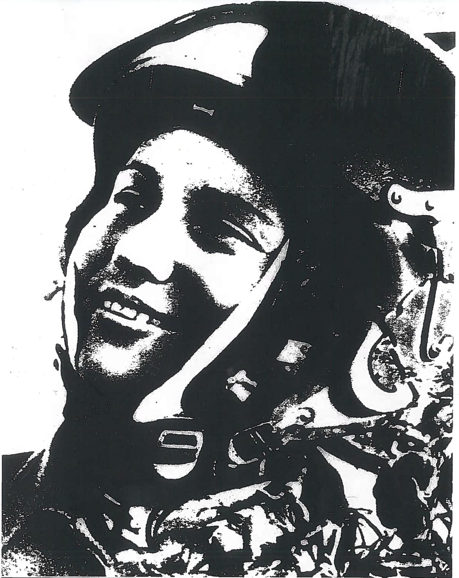
Soviet Air Force Col. Marina L. Popovich, Ph.D., in full flight gear during flight training at the jet flight training school. Circa: 1954. The enduring legend of Russia's "Madame MIG" is born.