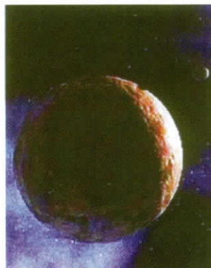
Artist conception of the planetoid Sedna.